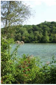
The Chattahoochee River