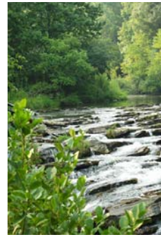
The Soque River

The most generally accepted story for the name of the river comes from the 1799 travel log of Benjamin Hawkins, an Indian agent: “The name of the river derived from “Chatto,” a stone, and “hoche,” marked or flowered; there being rocks of that description in the river above the Hoithletigua at an old town Chattahoochee.